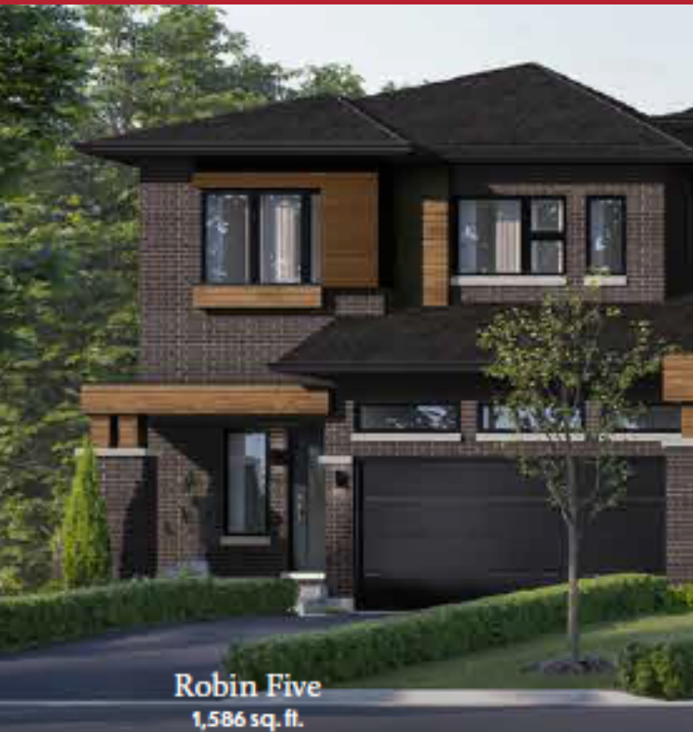
Robin Five 1,586 sq. ft.