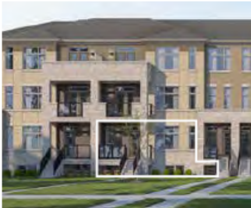
FRONT, Interior Unit