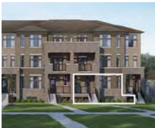
FRONT, Interior Unit