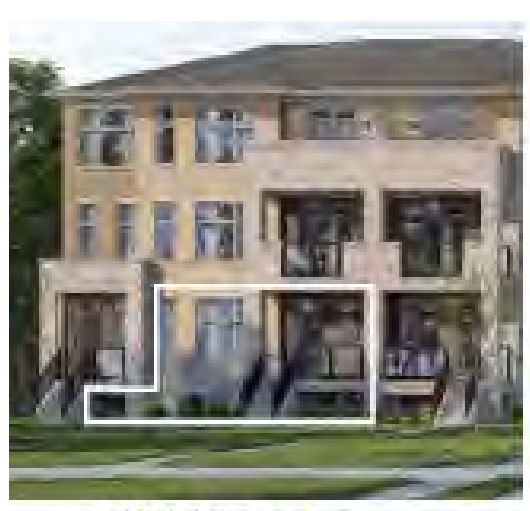
FRONT, Interior Unit